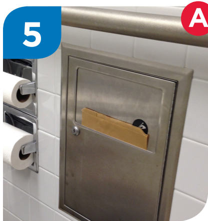
Empty and disinfect sanitary napkin disposal bins. Use appropriate Blood-borne Pathogen procedures if blood is present. Disinfect bin exterior. Place new liner.