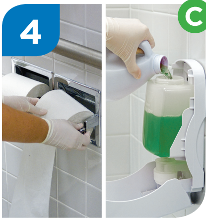
Refill towels, toilet tissue, feminine products, and soap.