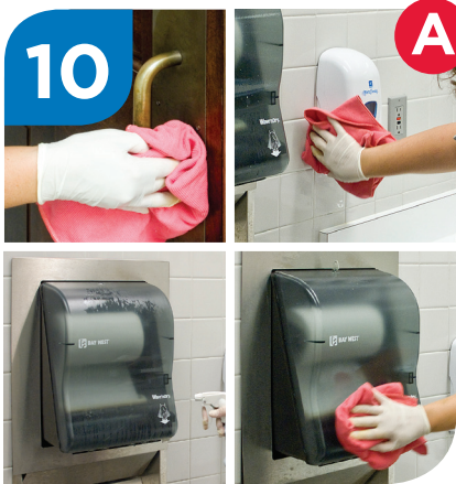
Disinfect door knobs, soap dispensers, and towel dispensers.