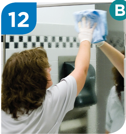
Clean mirrors with a clean cloth and glass cleaner.