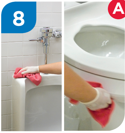
Change cloth, disinfect outside of bowl and urinal.