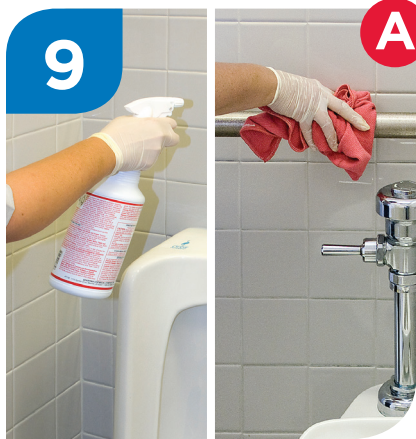
Disinfect walls and partitions around urinal and toilets.