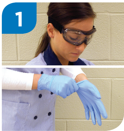
Put on proper protective wear.