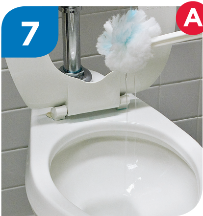
Apply solutions inside of toilet bowl and urinals.