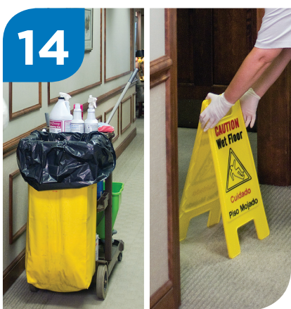
Clean equipment and return to storage room. When the floor is dry, remove "Wet Floor" signs.