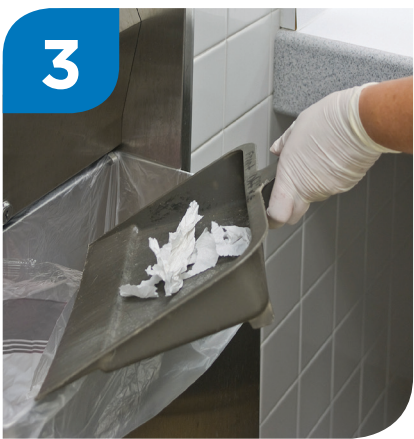
Pick up litter and sweep floor with microfiber dust mop.