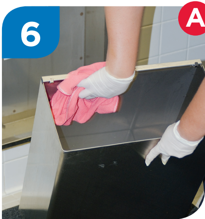
Empty and disinfect interior and exterior waste receptacles. Place new liner.