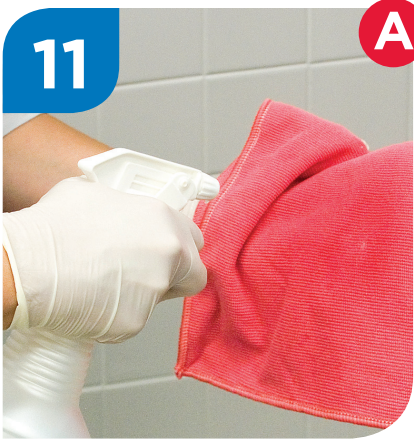
Using a damp, clean cloth, clean and disinfect sink, faucets, and counter-tops.