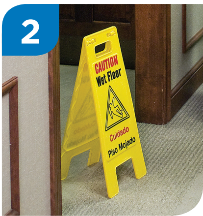
Place "Wet Floor" signs.