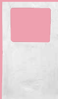
LBSF500HD U.S. Patent No. 9,957,105

Scensibles® poly liner bags can be used with most common surface or wall mount, and recessed receptacles. (See reference guide)