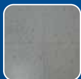
VCT (Vinyl) tile and linoleum