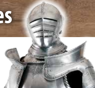
Your First Line of Defense!

Preserve Floors | Reduce Chair Noise | Move Furniture Easily