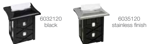
6032120 black 6035120 stainless finish

Dispenser Dimensions (H x W x D) 13.5" x 9.9" x 7.0" (34.29 x 25.15 x 17.78cm) Dispenser/Case 1 Dispenser Capacity up to 600 napkins