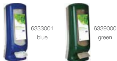
6333001 blue 6339000 green

Dispenser Dimensions (H x W x D) 24.5 x 9.25 x 9.25 (62.23 x 23.5 x 23.5 cm) Dispenser/Case 1 Dispenser Capacity up to 1000 napkins