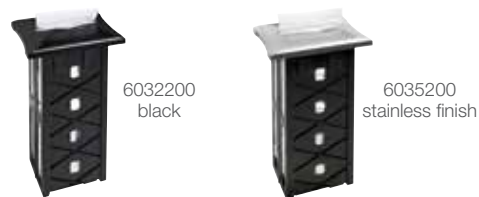
6032200 black 6035200 stainless finish

Dispenser Dimensions (H x W x D) 21.5" x 9.9" x 7.0" (54.61 x 25.15 x 17.78cm) Dispenser/Case 1 Dispenser Capacity up to 1000 napkins