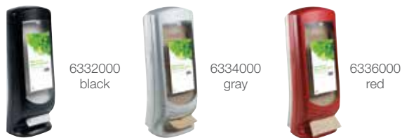
6332000 black 6334000 gray 6336000 red