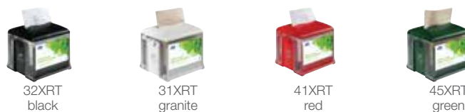
32XRT black 31XRT granite 41XRT red 45XRT green

Dispenser Dimensions (H x W x D) 6.2" x 5.875" x 5.875" (15.75 x 14.92 x 14.92cm) Dispenser/Case 4 Dispenser Capacity up to 200 napkins